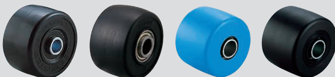
PB Phenol wheel (including B) GNB Reinforced nylon wheel MC MC nylon wheel (including B) MCE MC nylon wheel (including B) (conductive)

Refer to P165 for detailed specifications.