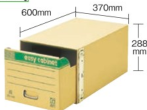
EC-001 (popular type)