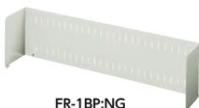
FR-1BP:NG (back panel)