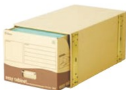
ECK-001 (reinforced type/file sold separately)