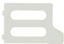
FR-1S:NG (partition panel)