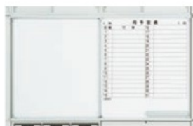
TSBW-L210 (slide board)