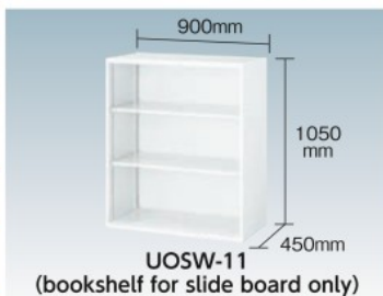
UOSW-11 (bookshelf for slide board only)