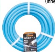
GHO-20 (inner diameter 15mm type)