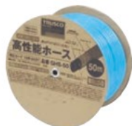
GHS-50 (inner diameter 12.5mm type)