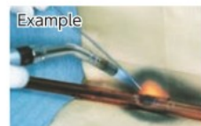
Example Ideal for pipe brazing work