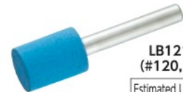
LB1215M (#120, blue)

Estimated Unit Price per Piece ¥573 to ¥685