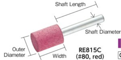
RE815C (#80, red)