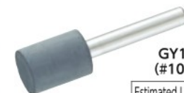
GY10015VS (#1000, gray)

Estimated Unit Price per Piece ¥573 to ¥685