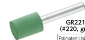
GR2215F (#220, green)

Estimated Unit Price per Piece ¥573 to ¥685