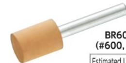
BR6015SF (#600, brown)

Estimated Unit Price per Piece ¥573 to ¥685