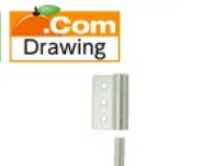
TLS-100LX (for left)