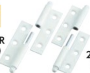
225-5030L (for left)