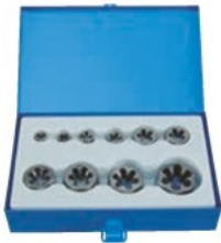
THD-CSET (set commodity)