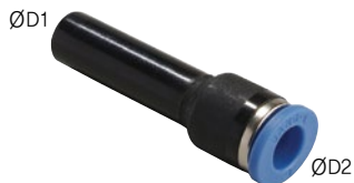
MODEL [ØD-T] Tube(Metric)-Thread(R)