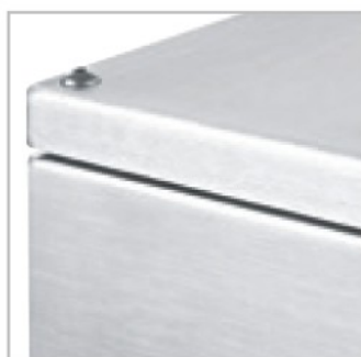
Standard: Surface polished.