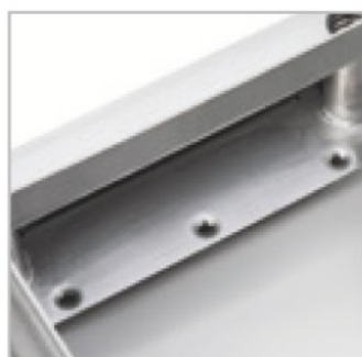
Standard: Fastening lugs in the bottom for internal mountings.