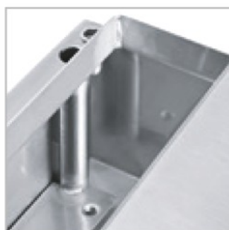
Standard: Assembly with fastening channels.