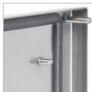
Standard: Earthing bolt in the lid.