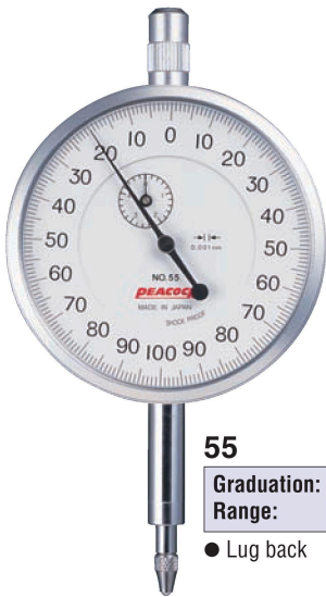
55 Graduation: 0.001mm Range: 5mm