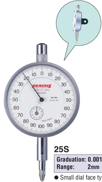
25S Graduation: 0.001mm Range: 2mm