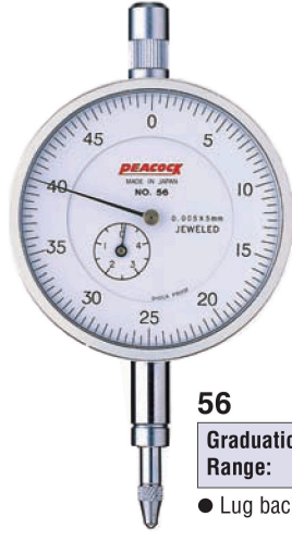
56 Graduation: 0.005mm Range: 5mm