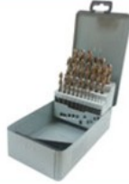
JOBBER DRILL SET IN METAL CASE