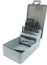
JOBBER DRILL SETS IN METAL CASES