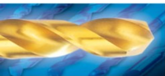
STRAIGHT SHANK DRILLS