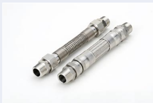
NK-FJP-B/ Spiral Corrugated Tube