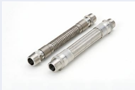
NK-FJP-A/Spiral Corrugated Tube