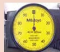
1mm per revolution