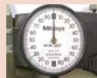
.200" per revolution