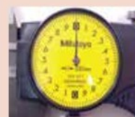
2mm per revolution