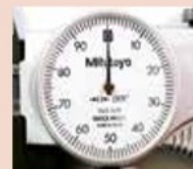
.100" per revolution