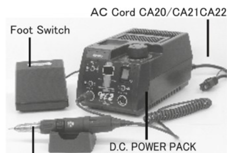
fig-2 A Motor is only included. Except the Motor, please purchase individually.

Not available with all the other powerpacks