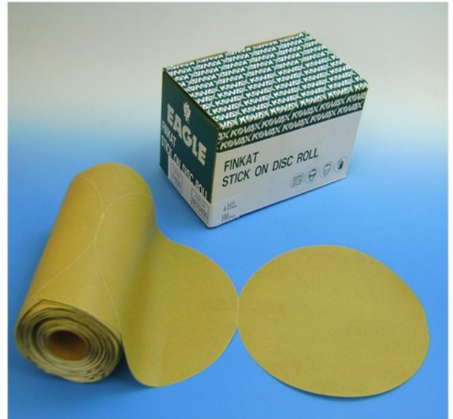
GCLMM-DR P400 152mm dia. P-0

Kovax new STICKON DISC ROLLS GCLMM-DR/ GCSMM-DR/GDSMM-DR utilize special flexible bonding technology that will effectively reduce scratches and increase cutting power. These high performance disc rolls with tough backing paper last long and produce superb finishes that will satisfy the most demanding requirements.