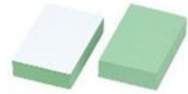
Assilex Pad AU Part No. 9710020 for sanding flat surface after painting primer surfacer (for AssilexLemon)