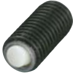
TBU-E 12025 - 16050 (Plain, Plastic Ball)