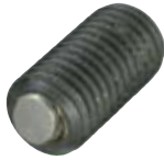
TBU-F 12025 - 16050 (Plain, Steel Ball)