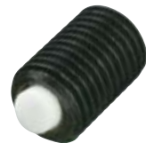
TBU-E 20030 - 24080 (Plain, Plastic Tip)