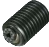
TBU-S 20030 - 24080 (Serrated, Steel Tip)