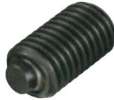
TBU-F 20030 - 24080 (Plain, Steel Tip)