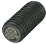
TBU-S 12025 - 16050 (Serrated, Steel Ball)