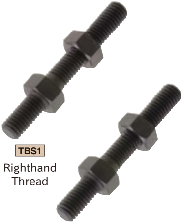
TBS1 Righthand Thread