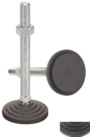
LVE (Conductive Design)