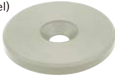
EW-SUS (Stainless Steel)