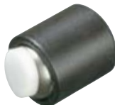
BBU-E 1722 - 3636 (Plain, Plastic Tip)