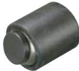
BBU-F 1722 - 3636 (Plain, Steel Tip)