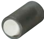
BBU-E 1012 - 1325 (Plain, Plastic Ball)