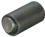
BBU-F 1012 - 1325 (Plain, Steel Ball)