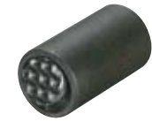
BBU-S 1012 - 1325 (Serrated, Steel Ball)