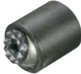
BBU-S 1722 - 3636 (Serrated, Steel Tip)