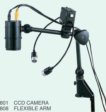
L-801 CCD CAMERA L-808 FLEXIBLE ARM L-705 LED FLEX NECK LIGHT