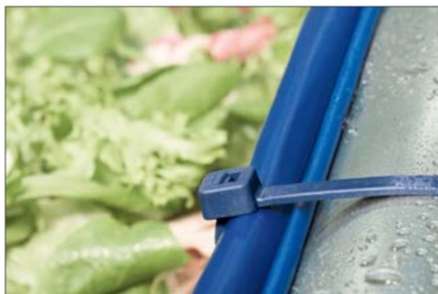
Our detectable MCT(S) cable ties are used in the food and pharmaceutical industry.

i More colours on request. Please contact us.