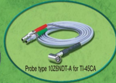
Probe type 10Z6NDT-A for TI-45CA

Probe for narrow and small measuring points